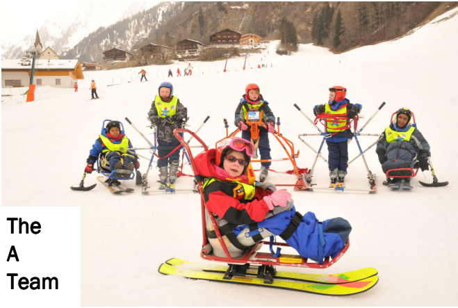
The A Team

We keep saying it, but yet another successful holiday and once again the youngsters all reached for those stars achieving far more than our expectations. A big THANK YOU to everyone who volunteered this year and made the holiday a memorable and a truly once in a lifetime opportunity for all the youngster's. We truly had a great team of helpers working together in the ethos of Katie's. We know its not right to single out individuals but we feel we